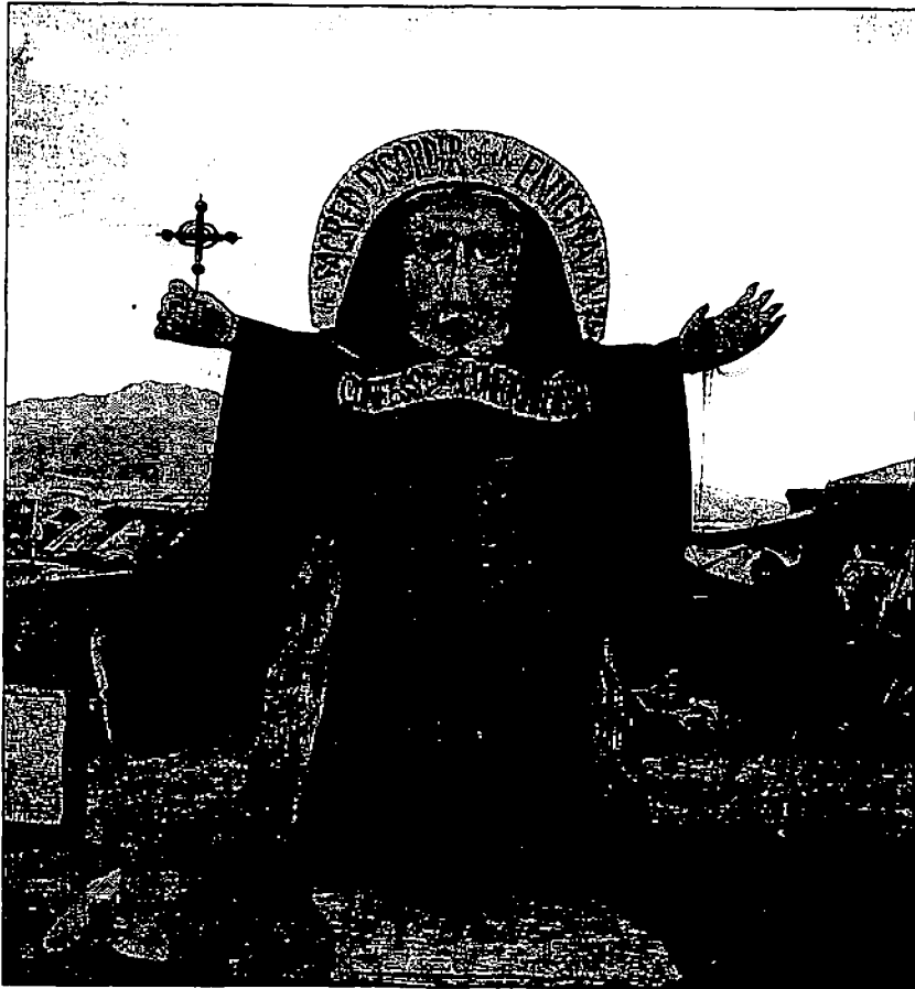
Figure 8.1 Interactive ritual art at Burning Man 1998.

When of Burning Man '98," a guide to festival events and exhibits, the Temple of Idle Worship is described as a "spiritual power point on the playa," but visitors to the temple are warned that "it makes no difference in what way you recognize this power as all forms of ritual and observance are meaningless here." In "Festival: A Sociological Approach," Jean Duvignaud writes that "all observers agree that festival involves a powerful denial of the established order" (Duvignaud 1976, 19). Folklorist Beverly Stoeltje explains that "in the festival environment principles of reversal, repetition, juxtaposition, condensation, and excess flourish" (Stoeltje 1992, 268). These principles are everywhere apparent at Burning Man, and help to give participants memorable experiences through contrasts between everyday life and the festival.