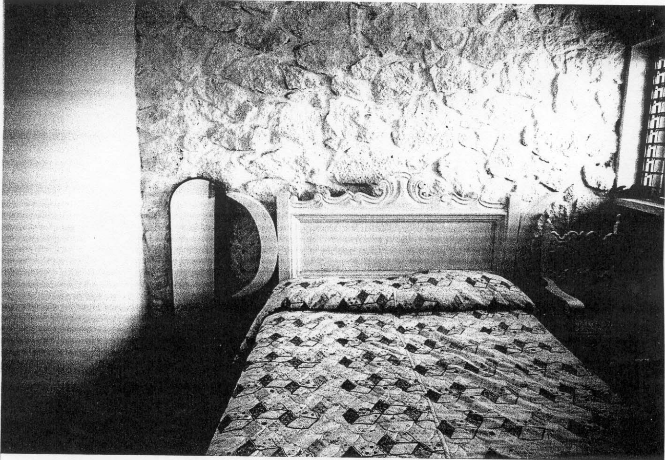
Dozens of stash houses in Mexican resort towns, like this one in Acapulco, shelter American pedophile rings.

the capital of the former Soviet republic of Moldova — the poorest country in Europe and the one experts say is most heavily culled by traffickers for young women — I saw a billboard with a fresh-faced, smiling young woman beckoning girls to waitress positions in Paris. But of course there are no waitress positions and no “Paris.” Some of these young women are actually tricked into paying their own travel expenses — typically around $3,000 — as a down payment on what they expect to be bright, prosperous futures, only to find themselves kept prisoner in Mexico before being moved to the United States and sold into sexual bondage there.