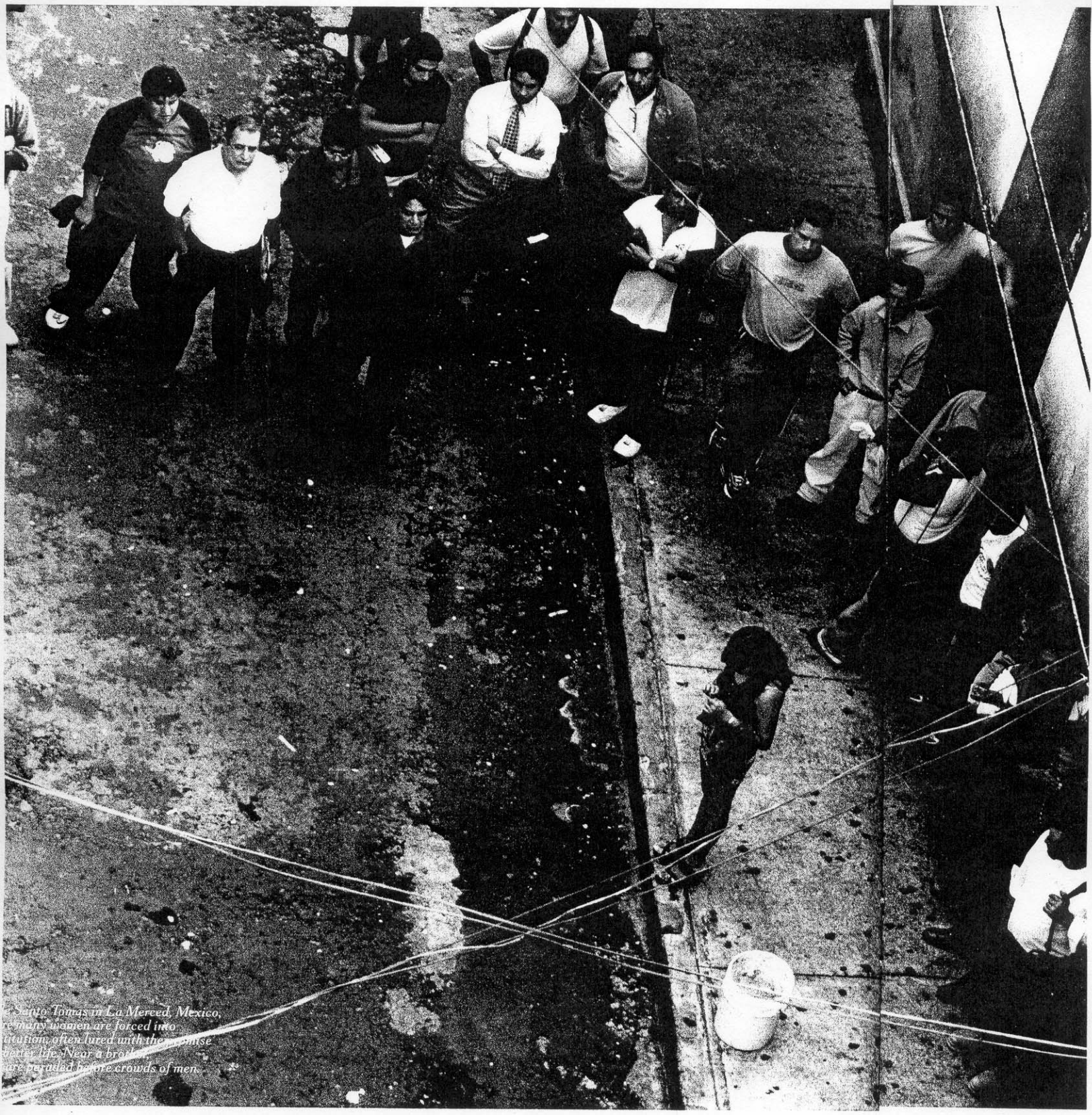
In Santo Tomás in La Merced, Mexico, many women are forced into prostitution, often lured with the promise of a better life. Near a brothel, they are harassed by large crowds of men.